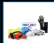
Safety & Gloves